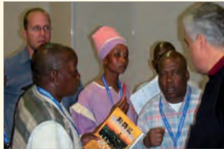
... and discussing his 10-Step-Programme with delegates at the World Summit