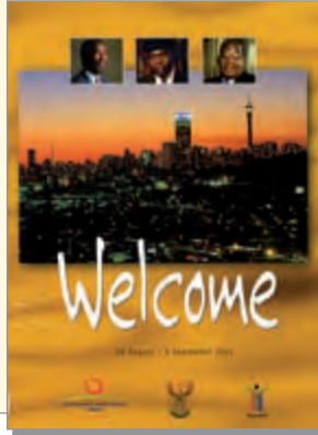
Cover page of the official programme of the Johannesburg World Summit 2002