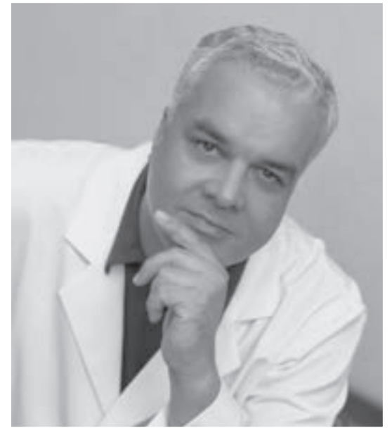
Dr. Matthias Rath is the physician and scientist who led the breakthrough in the natural control of cardiovascular disease and cancer. He is member of the New York Academy of Sciences and other renowned scientific organizations. 10 years ago, the late Dr. Linus Pauling, recipient of the Nobel Prize in Chemistry and Peace stated: "Your discoveries are so important for millions of people that they threaten entire industries. One day there may even be wars just to prevent this breakthrough from being widely accepted. This is the time, when you need to stand up!" - This time is now.-

This war is not a sign of strength - but of desperation.