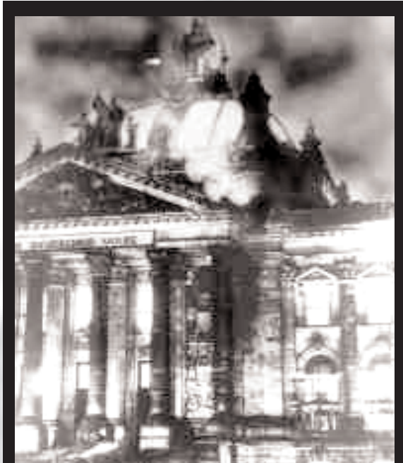
February 28, 1933 - 70 Years Ago -

The Reichstag-Assault in 1933 provided the legal platform for 12 years of dictatorship and WWII. Its main benefactor was IG-Farben, the largest European petro-chemical Cartel seeking control of the oil and chemical industry worldwide.