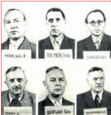
Executives of the world's largest pharmaceutical company were sentenced for crimes against humanity including slavery and mass murder in the Nuremberg Tribunal in 1948.

These organisations should know that, sooner rather than later, the people victimised by them will no longer stay silent. They will hold the perpetrators of this fraud responsible – both individuals and organisations.