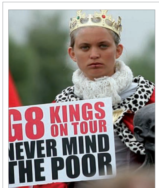
An aptly dressed protestor outside the 2007 G8 conference.

The pharmaceutical industry’s crimes, both against millions of cancer patients and millions of AIDS patients, have reached genocidal dimensions. In industrialized nations, the motives of the pharmaceutical industry in committing crimes against millions of cancer patients can be explained by the insatiable greed of this industry. However, in the case of pharmaceutical business with the AIDS epidemic in Africa, a whole new political and economic level must be added.