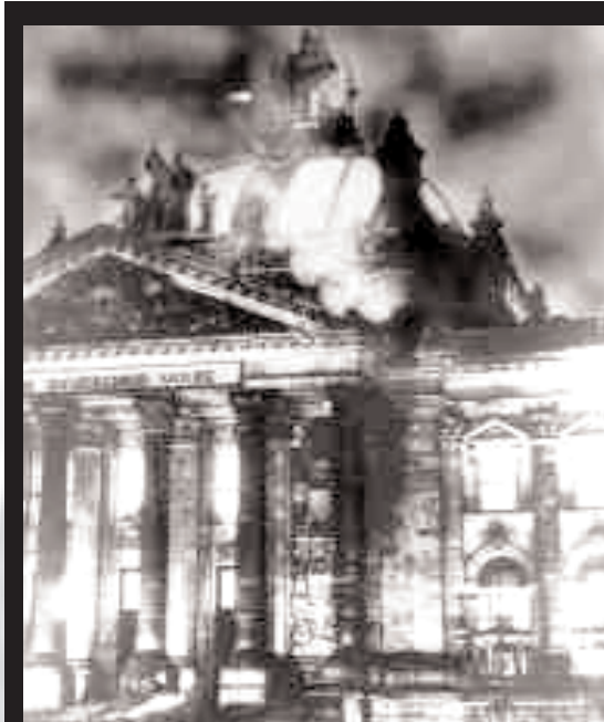
February 28, 1933 - 70 Years Ago -

The Reichstag-Assault in 1933 provided the legal platform for 12 years of dictatorship and WWII. Its main benefactor was IG-Farben, the largest European petro-chemical Cartel seeking control of the oil and chemical industry worldwide.